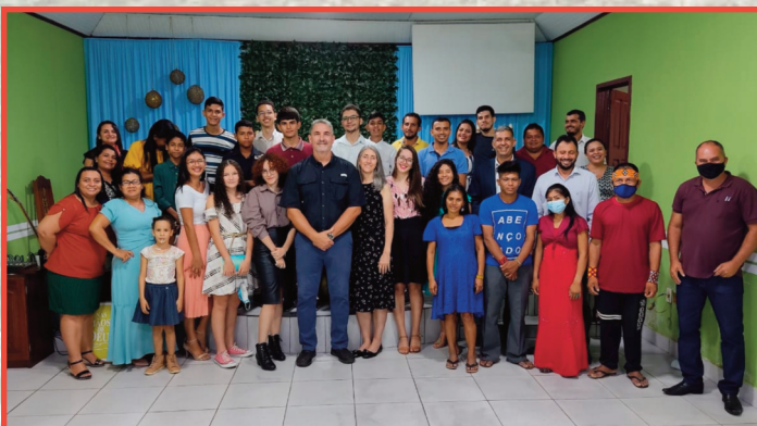
The Church anniversary service

We praise the Lord that the activities in the church here in Feijo are returning to some sort of normality. Many people in our town have now received their vaccines. We have commenced visitation and outreach in the town and surrounding areas and just recently celebrated 50 years of the work here in Feijo. Many people attended the thanksgiving services and the special conference entitled, "Challenges for the church in difficult times". God has blessed the work here over the years and many have come to know the Lord in a personal way.