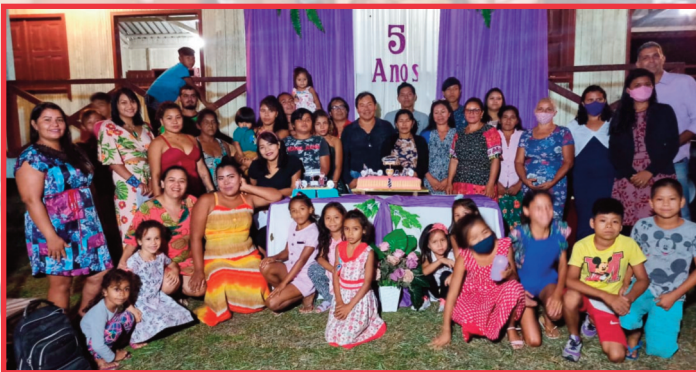
The Indian tribe 5 th Year anniversary service

We praise the Lord that the activities in the church here in Feijo are returning to some sort of normality. Many people in our town have now received their vaccines. We have commenced visitation and outreach in the town and surrounding areas and just recently celebrated 50 years of the work here in Feijo. Many people attended the thanksgiving services and the special conference entitled, "Challenges for the church in difficult times". God has blessed the work here over the years and many have come to know the Lord in a personal way.