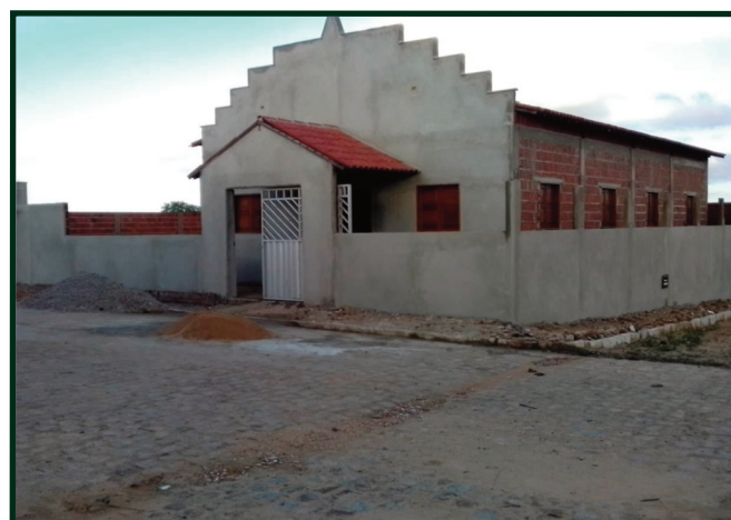
Picture above is the new church building and the picture to the left is the Ladies Ministry